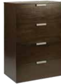
47604-54 FOUR DRAWER CHEST 30"W x 20"D x 42"H