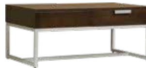
47593SKD-54 COFFEE TABLE 41 1/2"W x 23 3/4"D x 17 3/4"H

For more information on any of the products shown here, as well as any of our other product lines please contact a sales representative today. Please note - products marked 'In Stock' are available as of this printing. Be sure to check with your sales representative for availability.