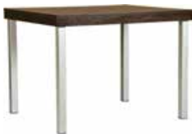
47586SKD-54 DINING TABLE 42"W x 36"D x 31"H