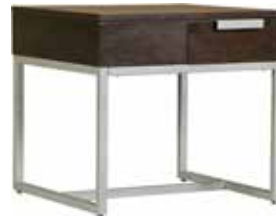
47599SKD-54 END TABLE 23 3/4"W x 23 3/4"D x 22 1/2"H