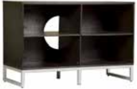
47731SKD-54 MEDIA CONSOLE 42"W x 18"D x 28"H