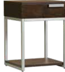
47596SKD-54 NIGHTSTAND 18"W x 18"D x 24 3/4"H