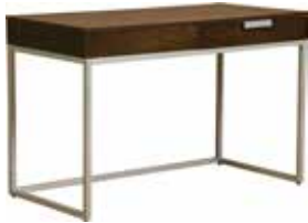
47986SKD-54 DESK 47"W x 23 3/4"D x 31"H