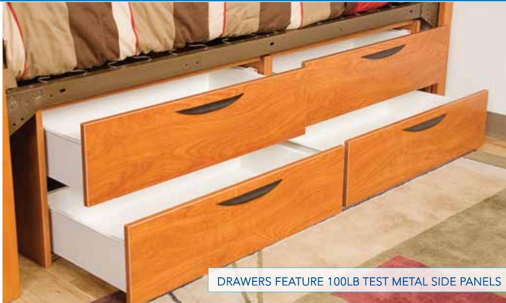
DRAWERS FEATURE 100LB TEST METAL SIDE PANELS