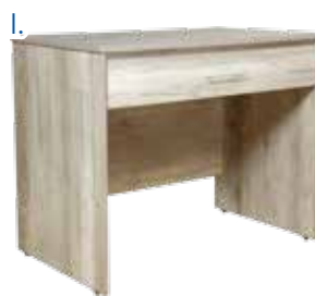
G. 92646-64 TWO DRAWER CHEST