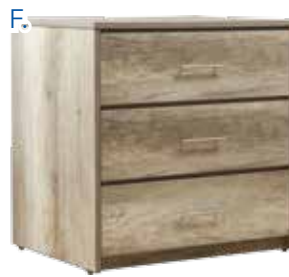
D. 92388-64 PEDESTAL