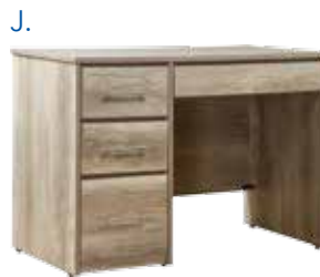
J. 92957-64 PEDESTAL DESK