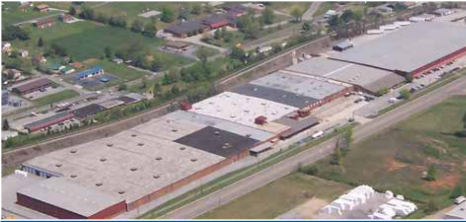
635,000 SQ/FT UPHOLSTERY PLANT/DISTRIBUTION FACILITY - MORRISTOWN, TN