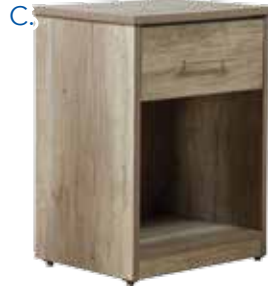
A. 92302-64 DESK CARREL